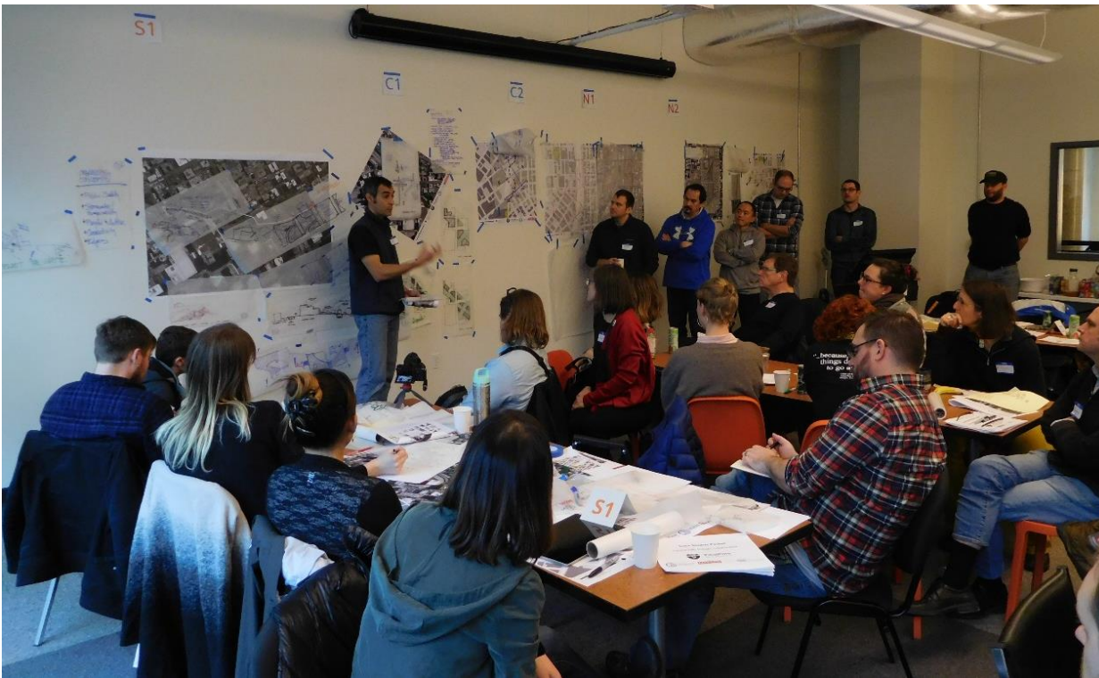
Participants at the CHTC Kickoff Charrette in January 2018.