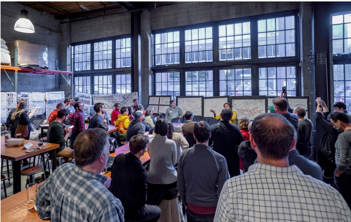
Participants at the CHTC Collab #1 in March 2018.