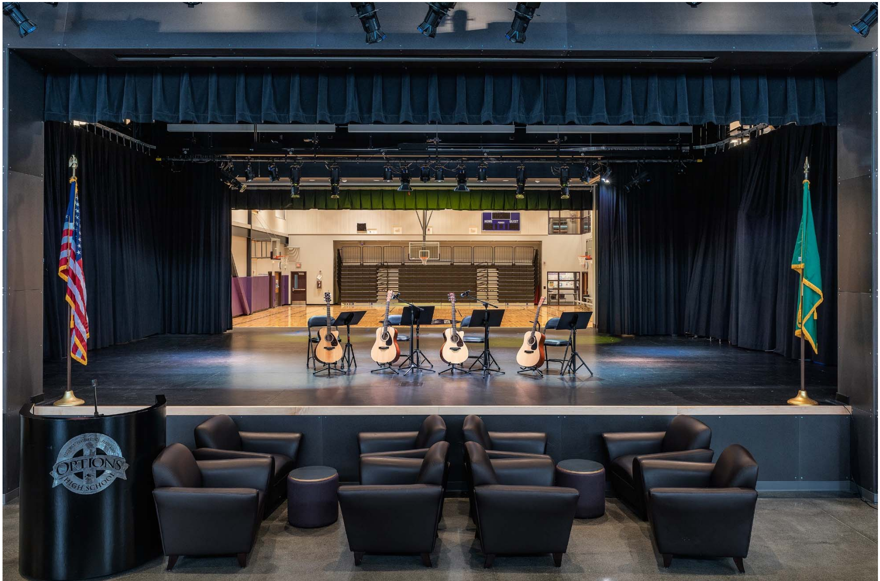
Black Box Theatre / Commons