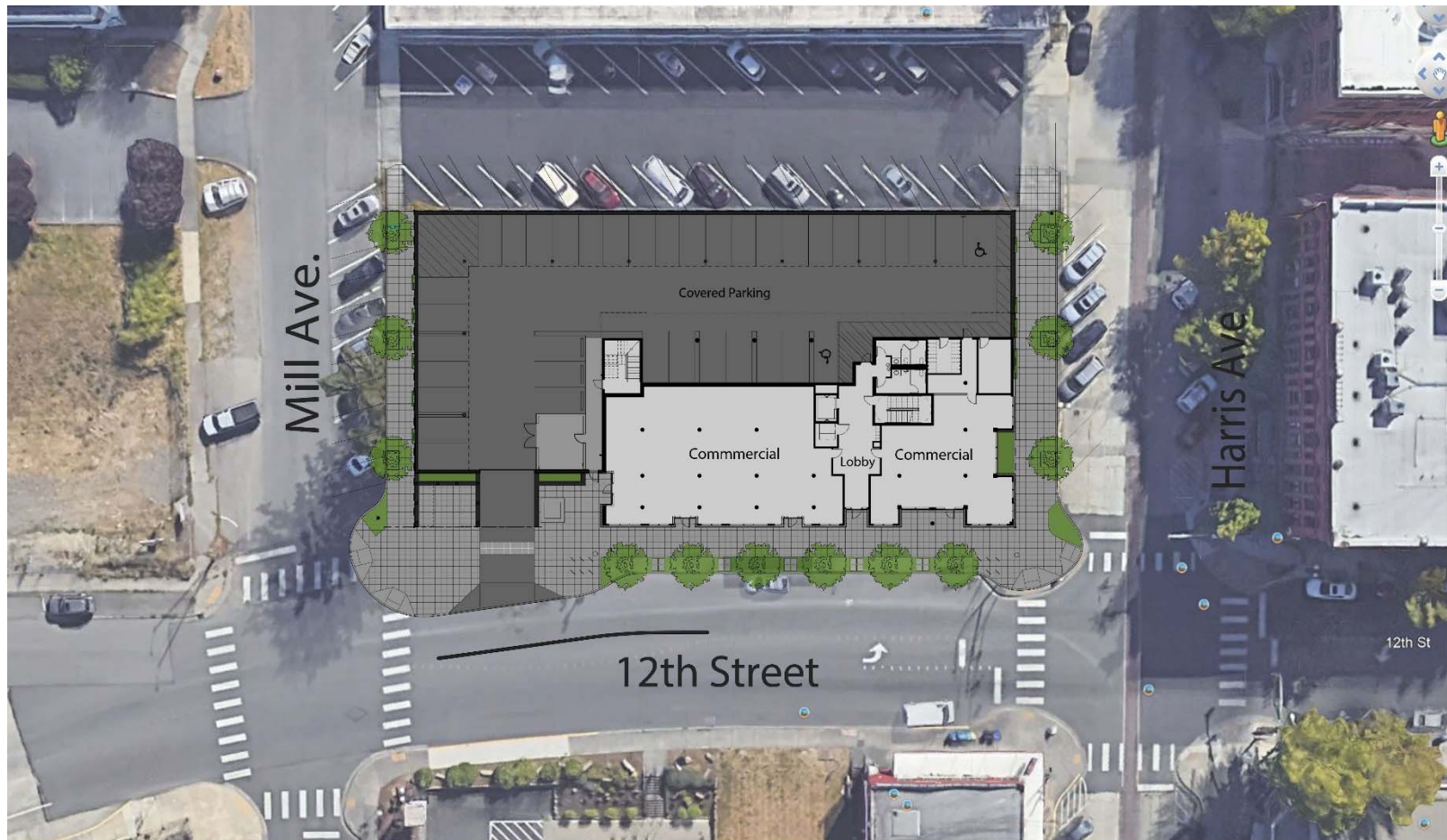
Fairhaven Tower Site Plan