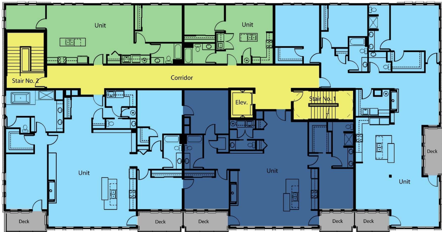
Fairhaven Tower Level - 5 Floor plan