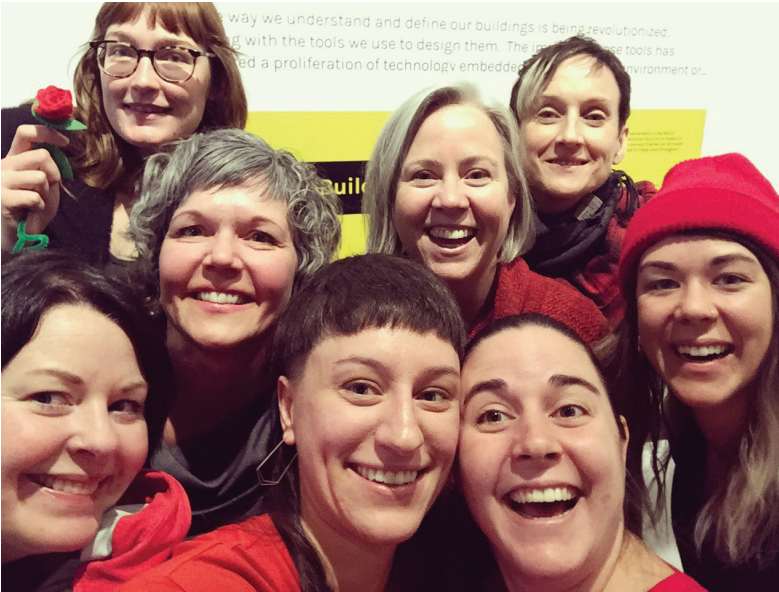
AIA Seattle Staff