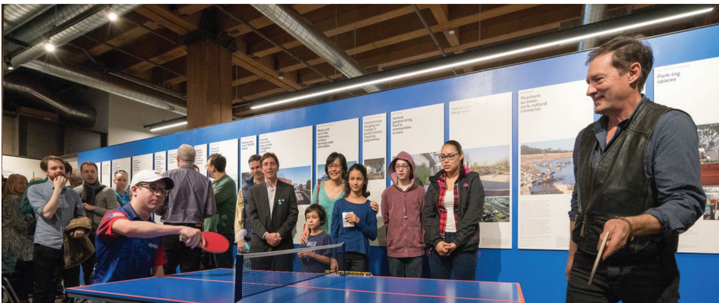
FitNation exhibit at the Center for Architecture & Design