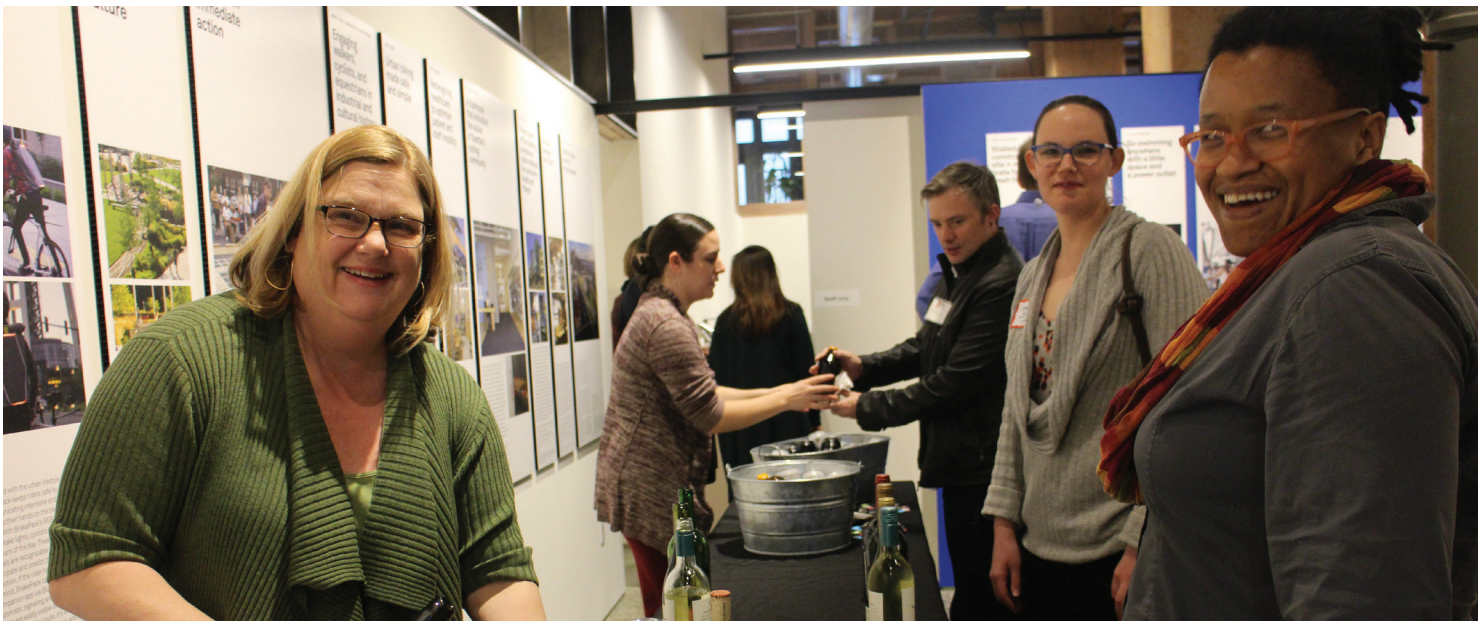
Staff and members at the Center for Architecture & Design opening reception