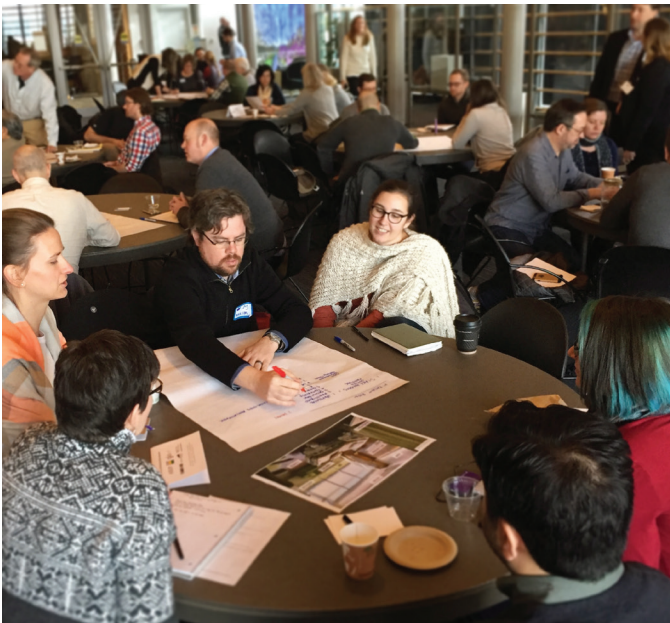
Materials Matter series