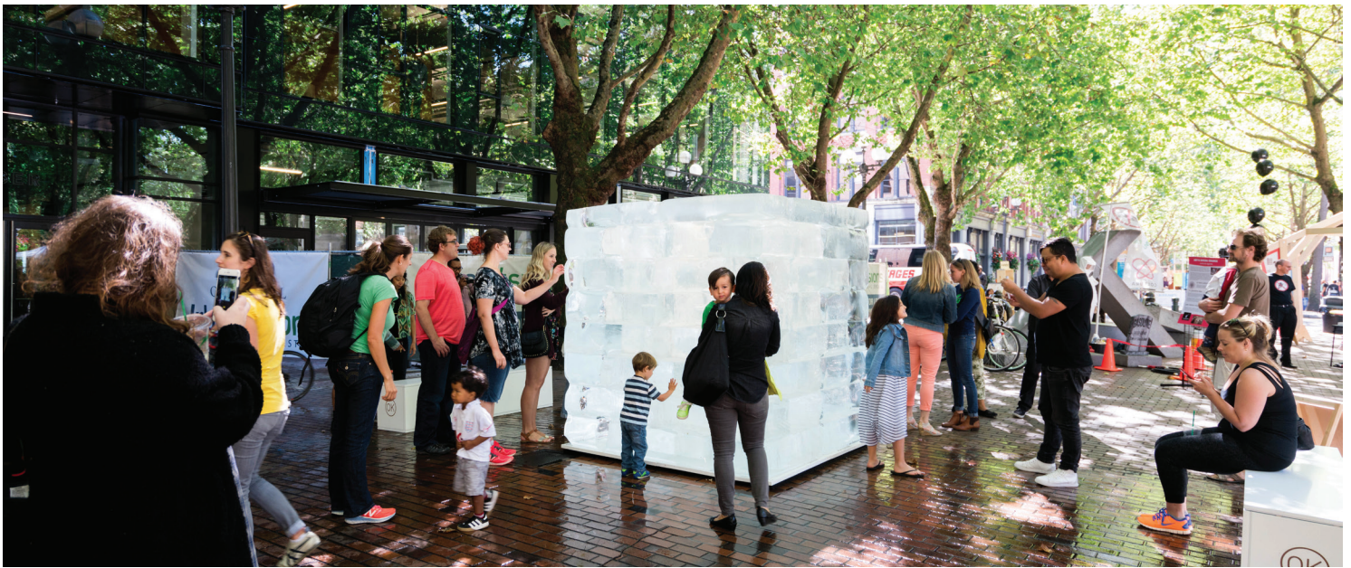
Seattle Design Festival Block Party – ICE CUBE by Olson Kundig