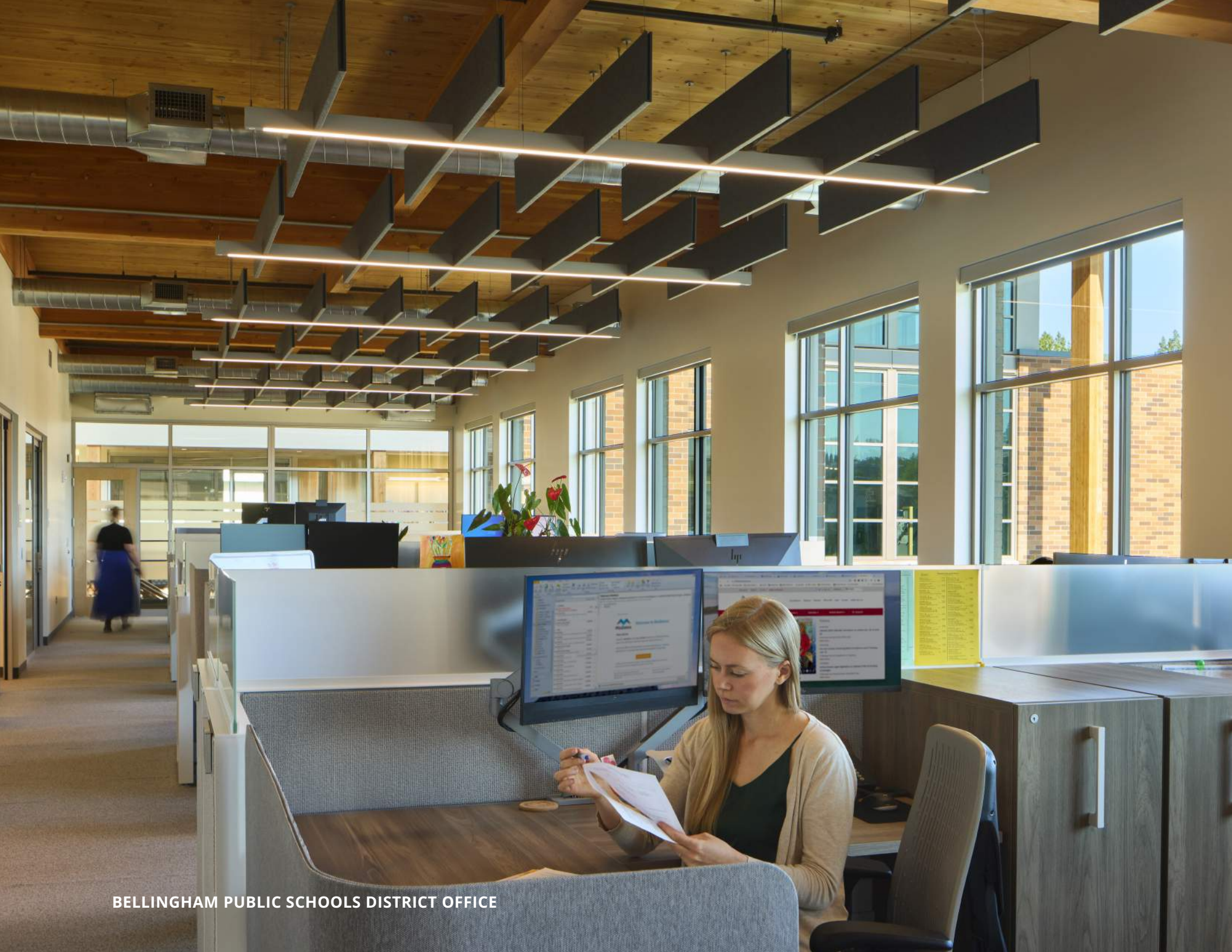
BELLINGHAM PUBLIC SCHOOLS DISTRICT OFFICE