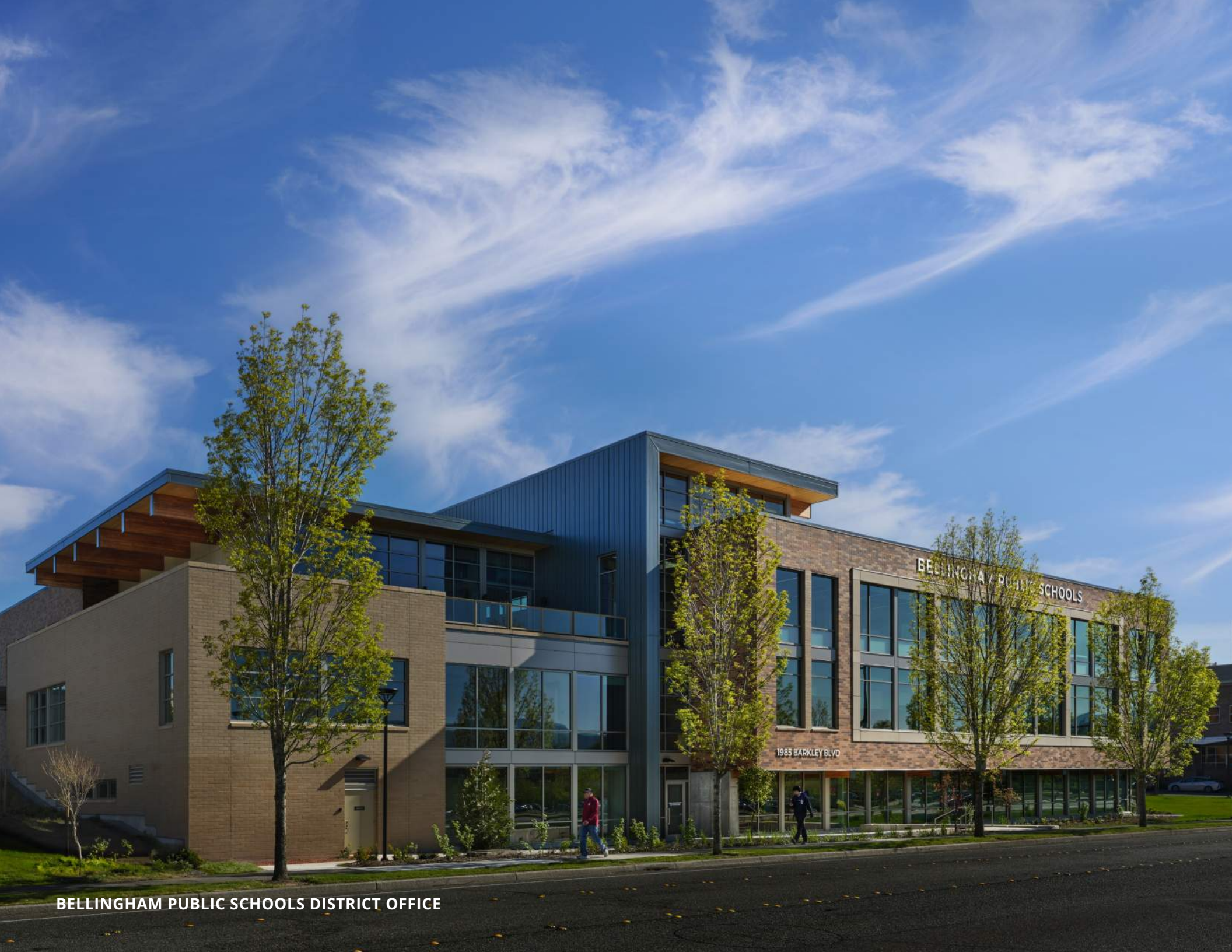
BELLINGHAM PUBLIC SCHOOLS DISTRICT OFFICE