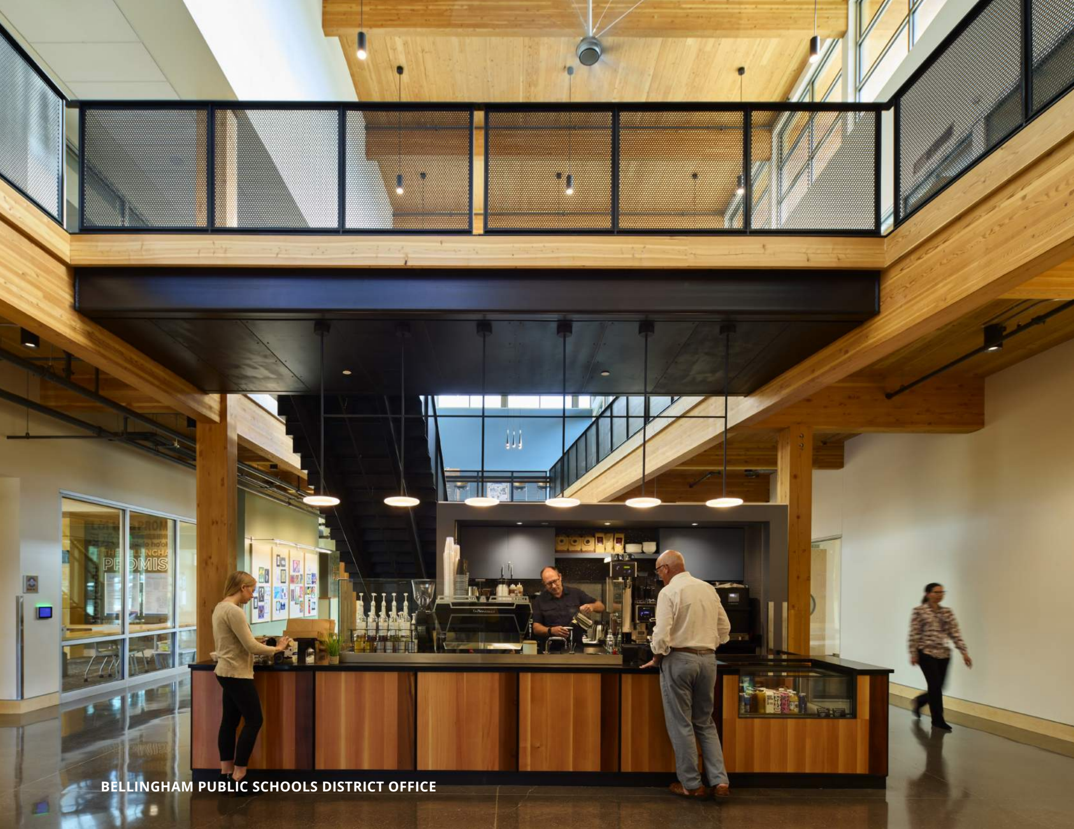
BELLINGHAM PUBLIC SCHOOLS DISTRICT OFFICE