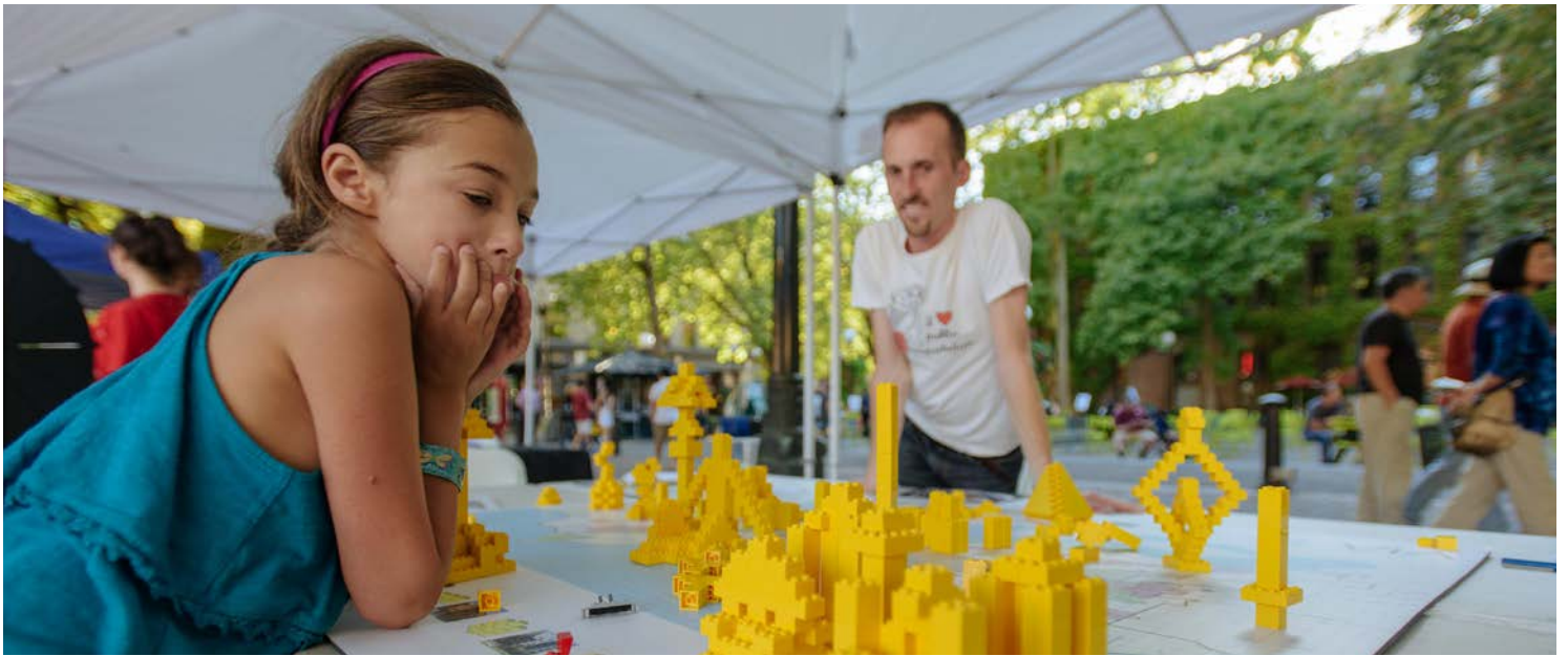
Seattle Design Festival Block Party