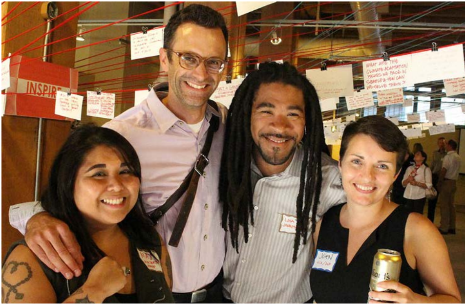
AIA Seattle Staff and Members at the Center for Architecture & Design Sneak Peek