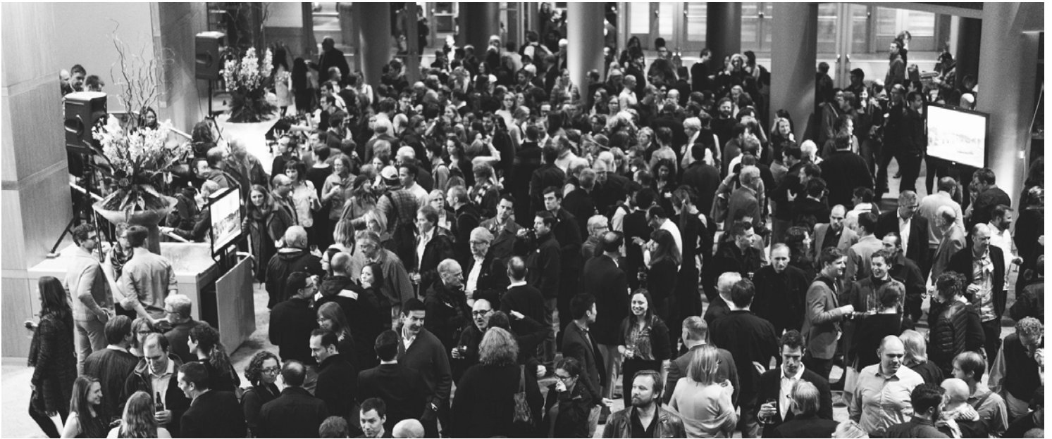
Honor Awards for Washington Architecture at Benaroya Hall