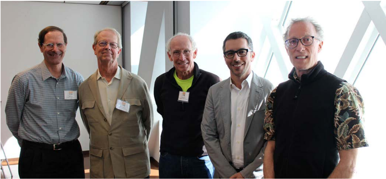
Residential Design Forum panel presenters