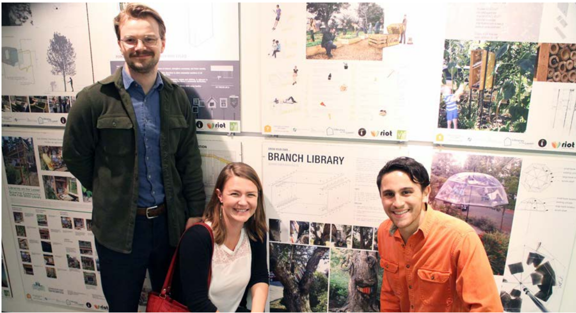
Libraries on the Loose!